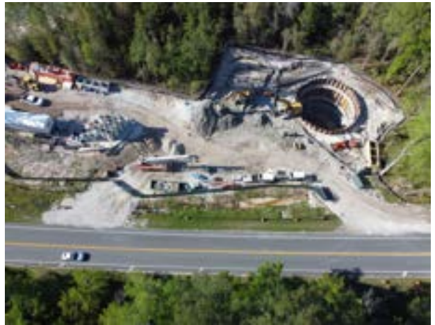
BLACK CREEK PUMP STATION: Only the site fence awaits completion. Left - Pump Station site on 9/22/24. Right - Pump Station site on 3/23/23.