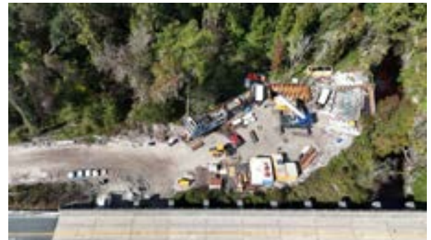
BLACK CREEK INLET SITE: Only the site fence awaits completion. Left - Inlet site on 9/22/24. Right - Inlet site on 3/23/23.

BLACK CREEK FLOODING deposited a large amount of sand from the creek onto the intake structure. Compressed air is released from the pump station to clear each section of the inlet grates.