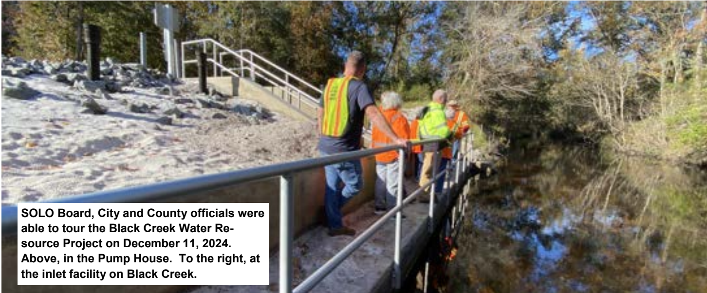
SOLO Board, City and County officials were able to tour the Black Creek Water Resource Project on December 11, 2024. Above, in the Pump House. To the right, at the inlet facility on Black Creek.

Brooklyn Level: 111.8 Ft Alligator Creek Flow: 14.5 MGD; Level: 111.85 Ft Geneva Level: 94.2 Ft S. Fork Black Creek (SR-16): Flow: 45.2 MGD: Level: 10.2 Ft Monthly Rainfall: .72" (Source: SJRWMD and USGS)