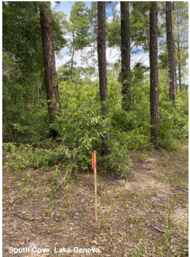
South Cove, Lake Geneva