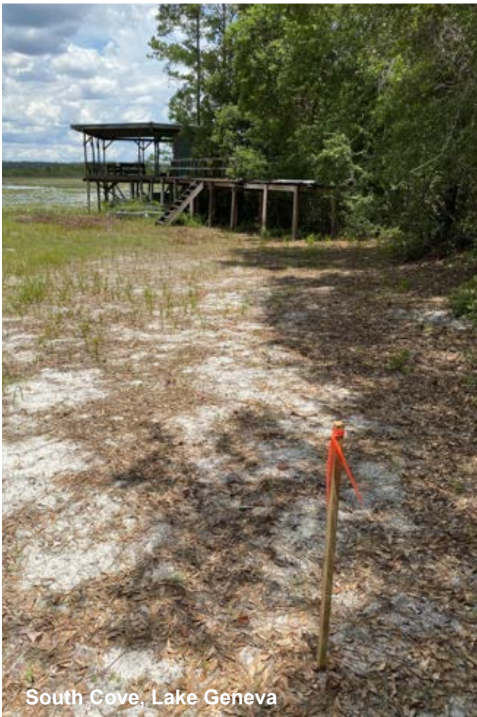
South Cove, Lake Geneva

Decades of community effort have brought us within weeks of seeing those efforts come to fruition! Vivian