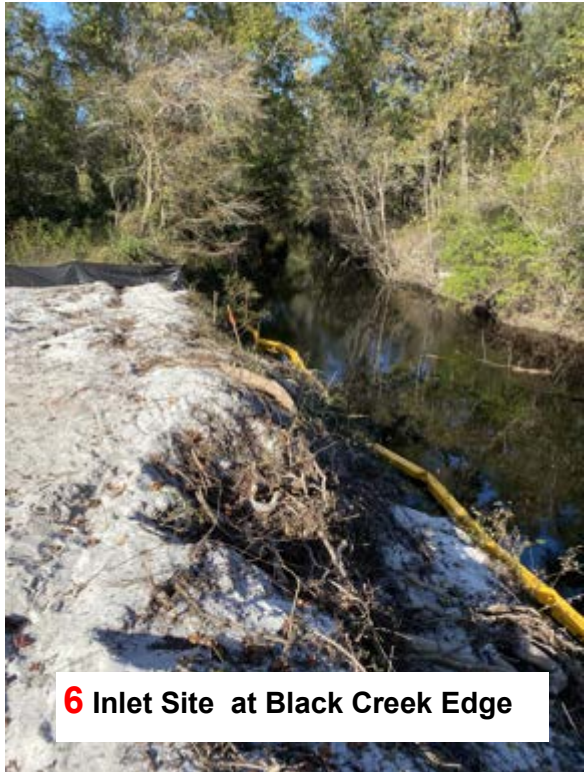
6 Inlet Site at Black Creek Edge