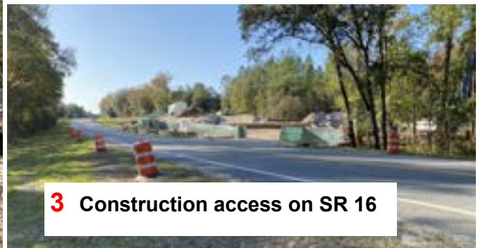
3 Construction access on SR 16