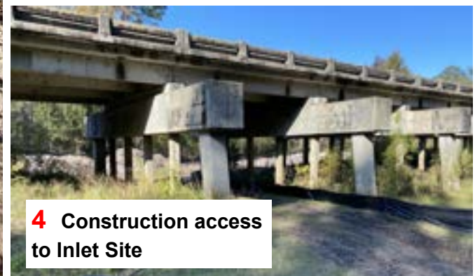
4 Construction access to Inlet Site