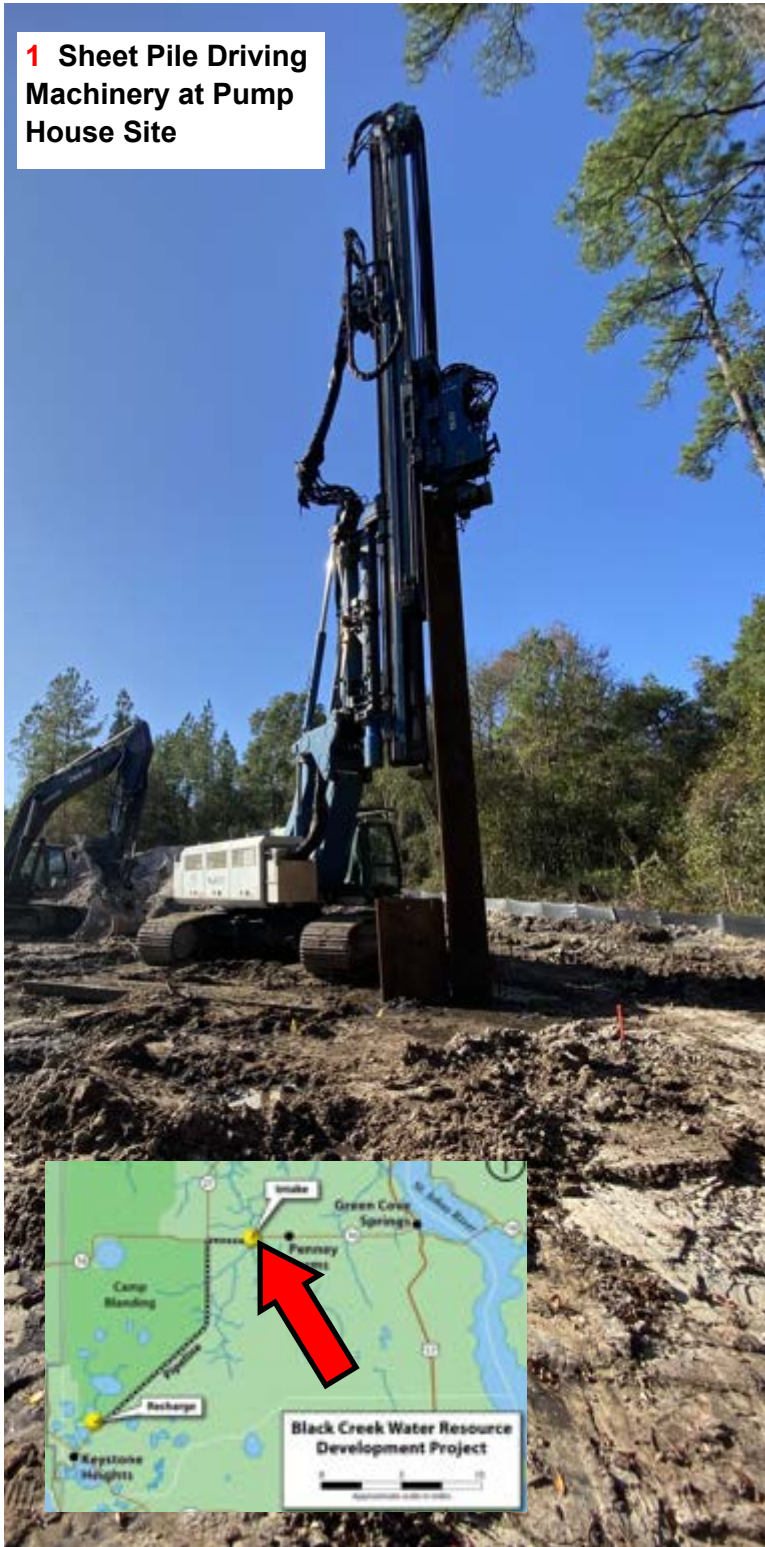
1 Sheet Pile Driving Machinery at Pump House Site