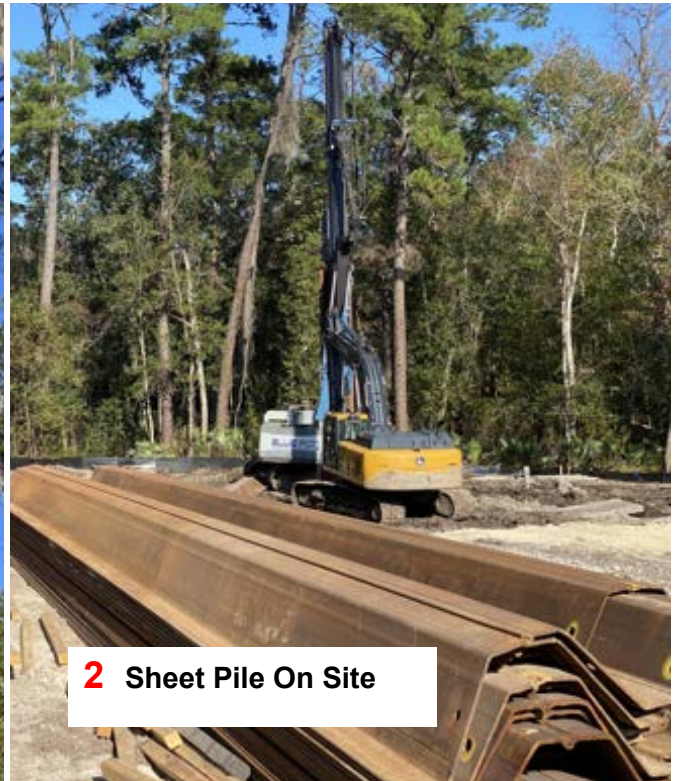
2 Sheet Pile On Site