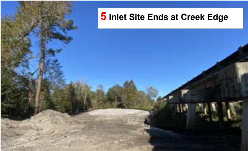
5 Inlet Site Ends at Creek Edge