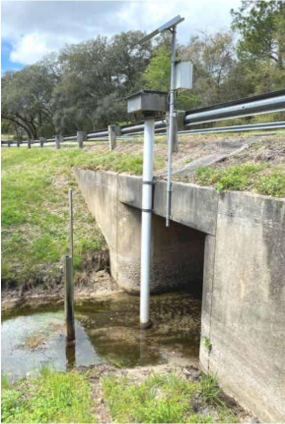
Alligator Creek at Immokalee Road 3/9/2020

At the recent Board Meeting, the question was asked: How much water is flowing in Alligator Creek now? Below is a way to find that information at any time: