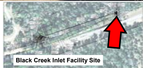
Black Creek Inlet Facility Site

At the Black Creek Inlet Facility Construction Site , on the left side of the photograph, sheet pilings are seen in place and dewatering equipment is being installed. Note that additional water filtration equipment (the white rectangular tank) is being employed. The close proximity of Black Creek, just on the other side of the black silt fence at the far edge of the construction site, is the likely reason for these extra precautions.