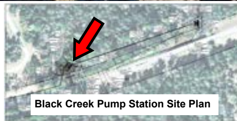
Black Creek Pump Station Site Plan

THE SHEET PILING at the Pump Station Construction Site extend some 40 feet into the earth. To de-water the site, well points have been placed on the inside and the outside of the sheet piles. The water is pulled into the PVC pipe manifolds by pumps (painted red) and discharged into a sediment tank (painted yellow). Here the water is separated from the other material. The collected water and sediment are removed from the site for proper disposal. Neither will be allowed to contaminate Black Creek. When the water on the inside of the sheet pilings reaches the required level, work will begin to remove the dirt and clay within. This will be done in stages until a foundation for the riser pipe can be built at the level of the horizontal pipe from Black Creek. (Cont. Pg 3)