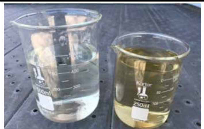
SJRWMD Photo of test water beakers from the Pilot Study Test The water discharged into Alligator Creek will meet water quality goals for Color, Total Lead, Total nitrogen, Total Organic Carbon and Total Phosphorous. It must equal or exceed the quality of water that is naturally existing in Alligator Creek.

“Met with DEP on Dec 17th 2021 to discuss responses submitted in November, 2021 to those questions raised by the EPA to the draft NPDES permit. DEP is