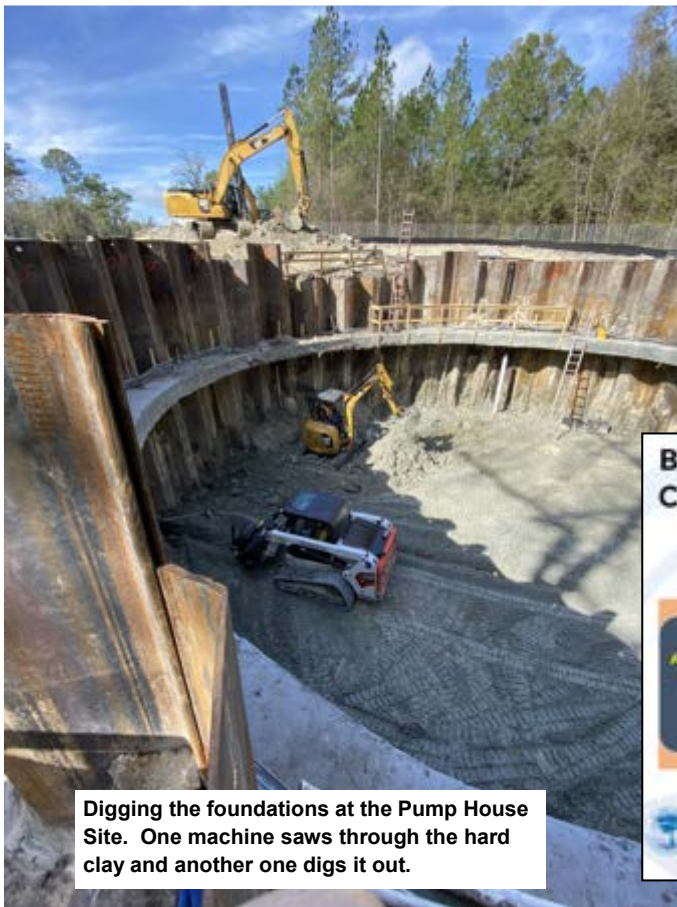
Digging the foundations at the Pump House Site. One machine saws through the hard clay and another one digs it out.