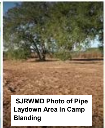
SJRWMD Photo of Pipe Laydown Area in Camp Blanding