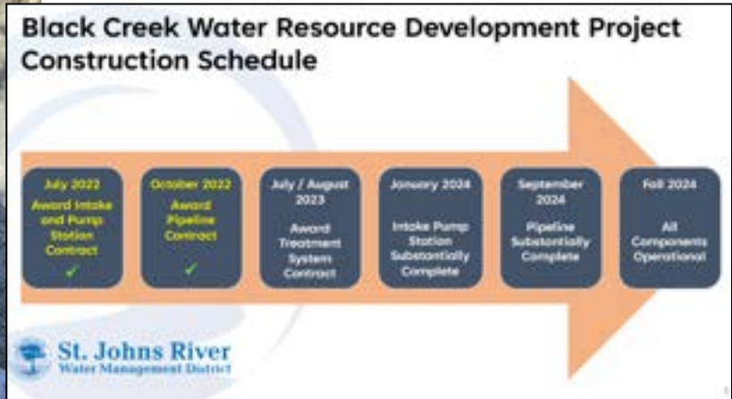
Slide from SJRWMD Progress Presentation to Governing Board 2/14/23