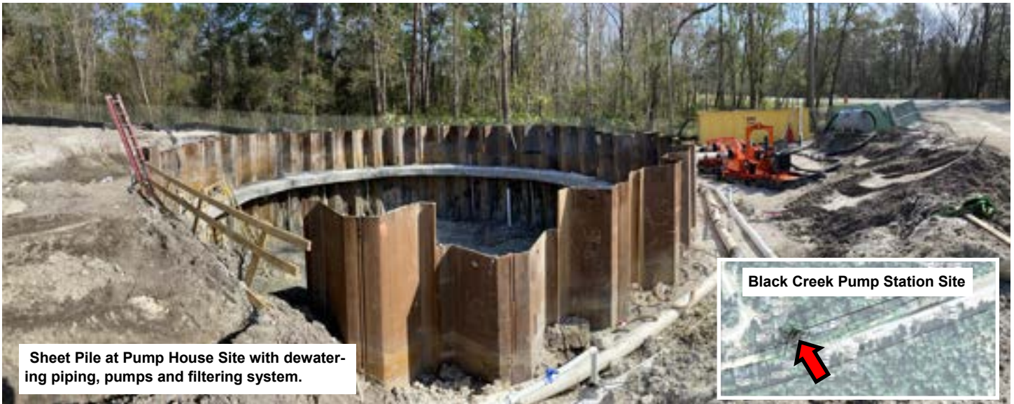
Sheet Pile at Pump House Site with dewatering piping, pumps and filtering system.