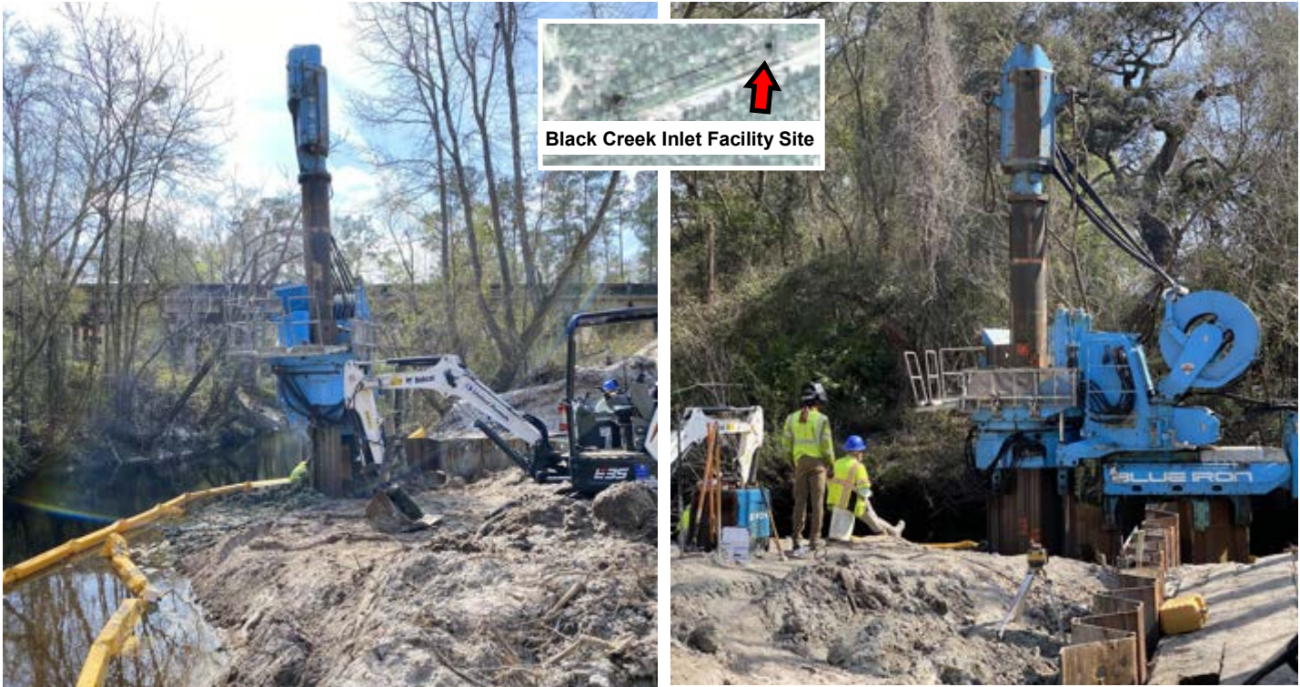
Black Creek Inlet Facility Site

At the Black Creek Inlet Facility Construction Site , in the left photograph, adjacent to Black Creek, sheet pilings are being driven in place with a machine that, because of variable hardness of the subsurface soils, works as an auger and as a hydraulic hammer. The machine sits on previously driven sheet piles as it works its way around the edge of what will be the foundation for the inlet facility. This complex machine is remotely controlled from a panel manipulated by an operator seen here seated on a bucket safely away from danger.