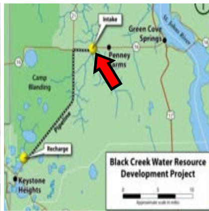
Black Creek Water Resource Development Project