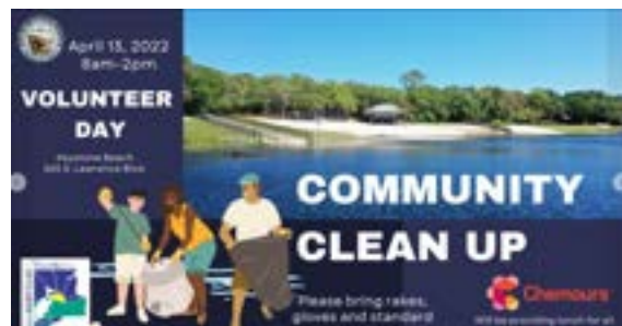
The City of Keystone Heights and Chemours held a KEYSTONE BEACH CLEAN UP DAY . With events soon to be held at the beach and the Pavilion, the volunteers helped both of them to look their best.