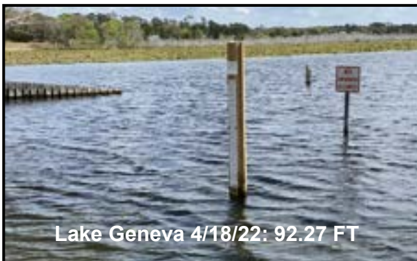
Lake Geneva 4/18/22: 92.27 FT

Webpage Design By: REALTY PRODUCTIONS CO. RealtyProductions.com – (904) 502-0165 - Email: wwwweb@realtyproductions.com